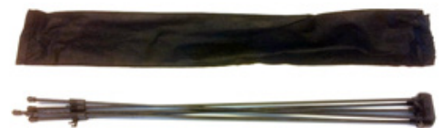
IMAGEM 150 X 55 CM

We recommend 200-310 g polyester bannermaterial